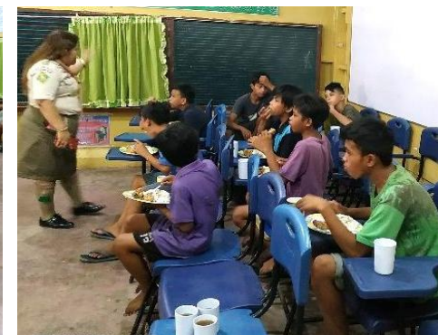
Free feeding to the streetchildren of Brgy. 20-A in partnership with the Spouses' Circle at Elpidio Quirino Elem. School. Oct. 12, 2019.