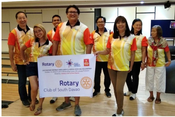
Rotary Inter-Club Bowling Tournament Opening hosted by RC East Davao at SM Lanang Bowling Center. Oct. 13, 2019