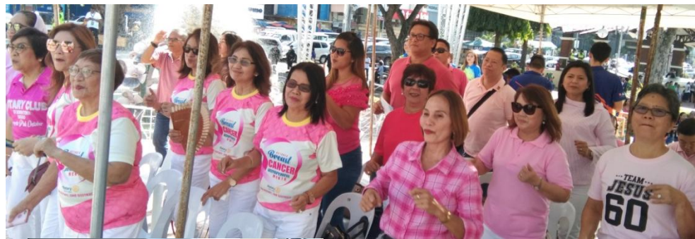
Pink October: Breast Cancer Awareness courtesy call and turnover of Anti-Polio Posters to Davao City Health Officer Josephine Villafuerte. Oct. 14, 2019